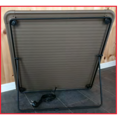
W-STAND PANEL SUPPORT